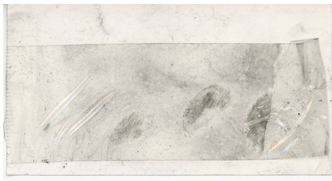
Image 2. These three latent fingerprints were deposited simultaneously on a plastic lid, obviously indicating that the lid had been touched. None of the three fingerprints, however, contain enough clarity or biological information to allow for a comparison. They are not of value.

If a police officer doesn’t understand a result – or perhaps doesn’t like the result – a simple phone call or email may provide the information needed for the officer to better understand. Even if the communication is through the Laboratory Feedback Form in the way of a criticism, that is better than no communication at all. None of us want the victim of a crime to be victimized a second time, this time by the very system that is in place to help.