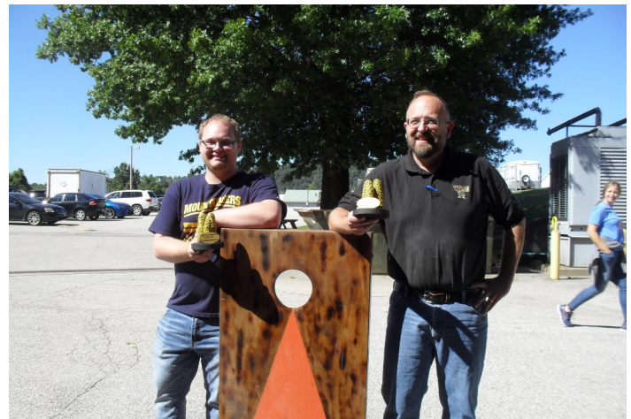
WINNERS OF THE FIRST INAUGURAL CORNHOLE TOURNAMENT

Special thanks to the Southridge Center Chick-fil-A in Charleston for generously donating breakfast to the Laboratory on September 23, for National Forensic Science Week!