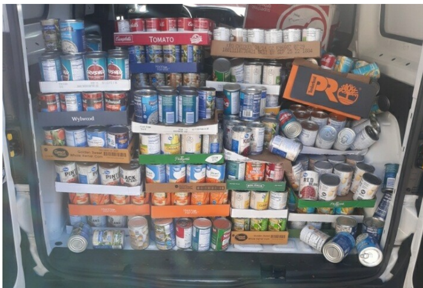
SOME OF THE CANNED FOOD DONATED BY THE WVSP FORENSIC LABORATORY

The National Forensic Science Week canned food drive conducted by the Forensic Laboratory was part of a larger Fall canned food drive being held among Midwestern Association of Forensic Scientists (MAFS) affiliated laboratories. MAFS is a regional forensic science organization; however it includes participants from across the United States, as well as international participants.