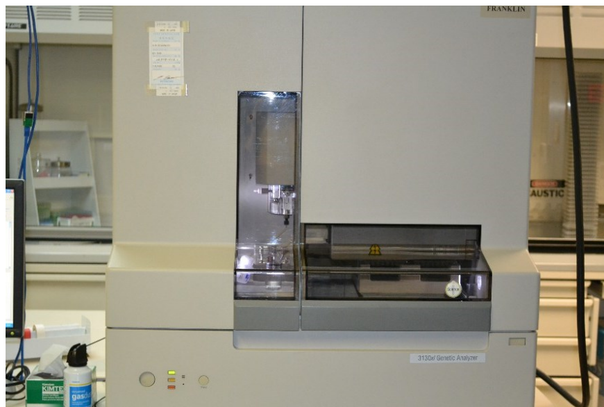
A 3130 Genetic Analyzer used to generate profiles for entires into CODIS.

UNTHSC requires that a file be opened on NamUs (National Missing and Unidentified Persons System) before submission to their laboratory. The NamUs site provides a central location for all interested parties to share information on cases involving missing persons and unidentified human remains.